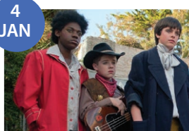
Ireland, 2016, John Carney. Comedy/ Drama/Music, 106 mins (12A).