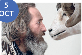
Iceland, 2015, Grímur Hákonarson Comedy/Drama, 93 mins (15).