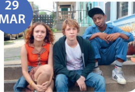
USA, 2015, Alfonso Gomez-Rejon Drama, 105 mins (12).