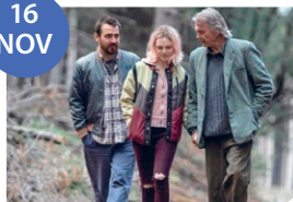
Australia, 2015, Simon Stone Drama, 96 mins (15).