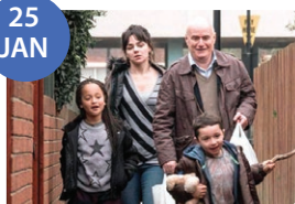
UK, 2016, Ken Loach Drama, 100 mins (15 tbc).