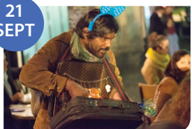
France, 2015, Jacques Audiard Crime/Drama/Thriller, 115 mins (15).