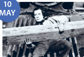
USA, 1926, Buster Keaton Adventure/Comedy, 78 mins (U).