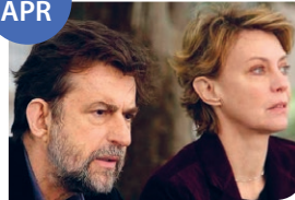
Italy, 2015, Nanni Moretti Drama, 106 mins (15).