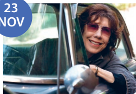
USA, 2015, Paul Weitz Comedy/Drama, 79 mins (15).