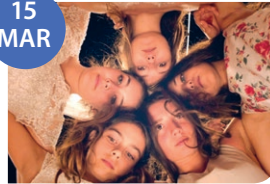
Turkey, 2015, Deniz Gamze Ergüven Drama, 97 mins (15).